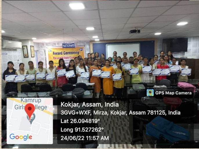
different related field of their choice.

3. Tailoring Course: The Tailoring Course has